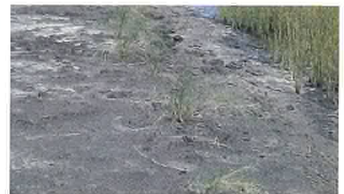
Above: Black Lake Terrace Tops 2012 Vegetation Project where 17,500 linear feet of Seashore paspalum, Saltgrass, and Marshhay cordgrass was planted atop the terraces located in Cameron Parish.

vaginatum ), and 6,000 Smooth Cordgrass ( Spartina alterniflora ). Gulf Coast SWCD Vegetative Technicians, Jaden Ardoin and Josh Soileau , oversee the program.