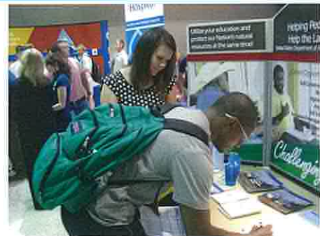
Career Day at McNeese State University

Since conservation is indeed a "team effort," it would be impossible to meet the goals of the District without the help of the District's many partners. With this in mind, the District would like to take this opportunity to thank its partners, NRCS, Imperial Calcasieu RC&D, LDAF, LNPI, Ducks Unlimited and other Federal, State and Local Agencies, Cooperators, Landowners, Land Users and area Educators who assist the District throughout the year to accomplish its goals for conservation.