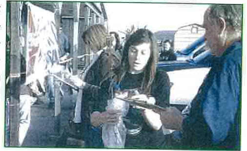
Above: The Grand Lake FFA Chapter partnered with NRCS/Gulf Coast SWCD for their 8th Annual Tree Seedling Sale. NRCS/Gulf Coast SWCD was very grateful for all their help and hard work.

your Water Shed?" During this week 25 student activity booklets, 25 activity sheets, 25 bookmarks, and 20 posters were distributed. Throughout the year, the District stays active in communicating with area educators to encourage them, to keep them informed of conservation activities and to provide assistance in teaching conservation.